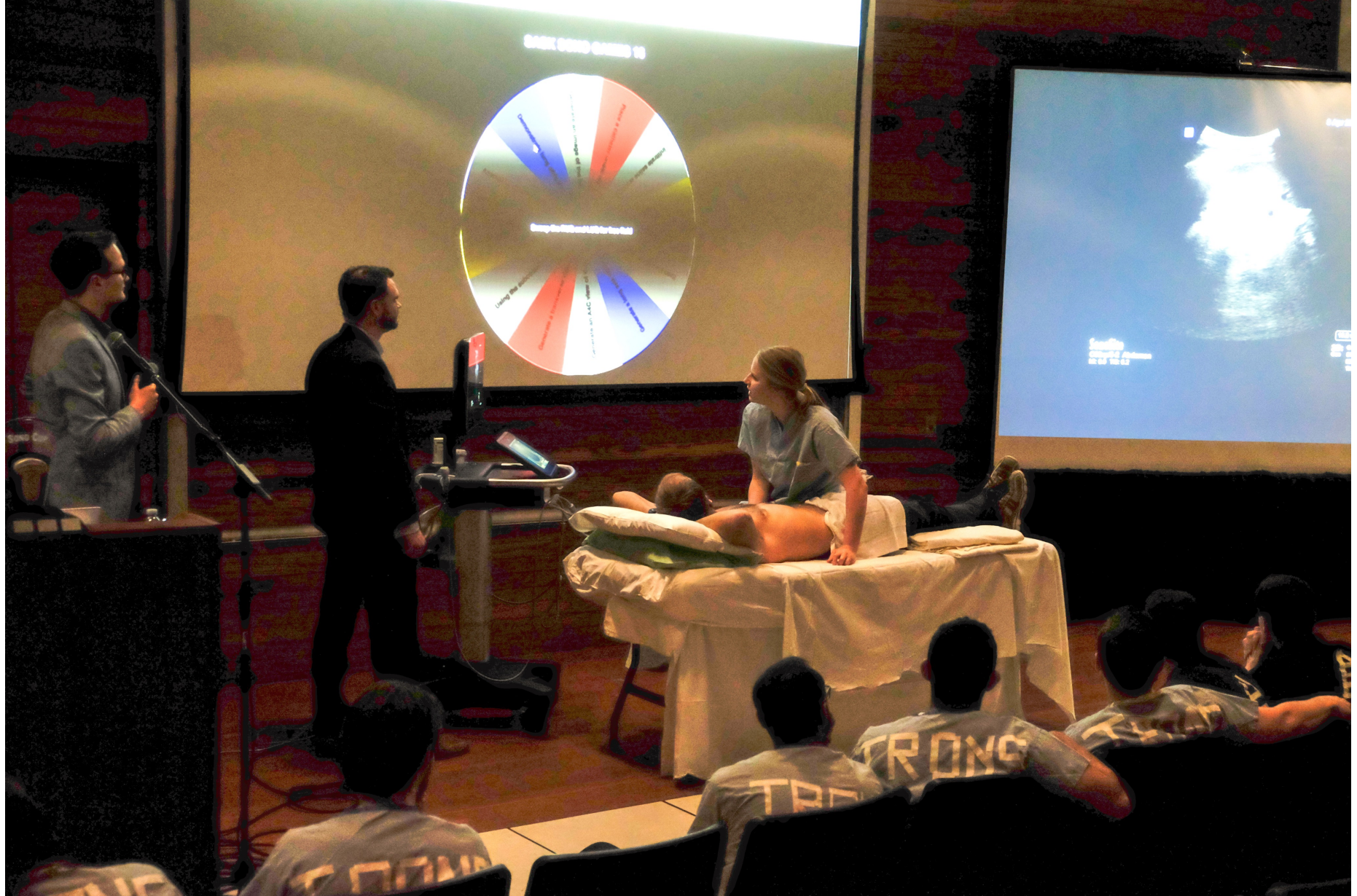
The Wheel of DOOM! SASKSONO17 SONOGAMES