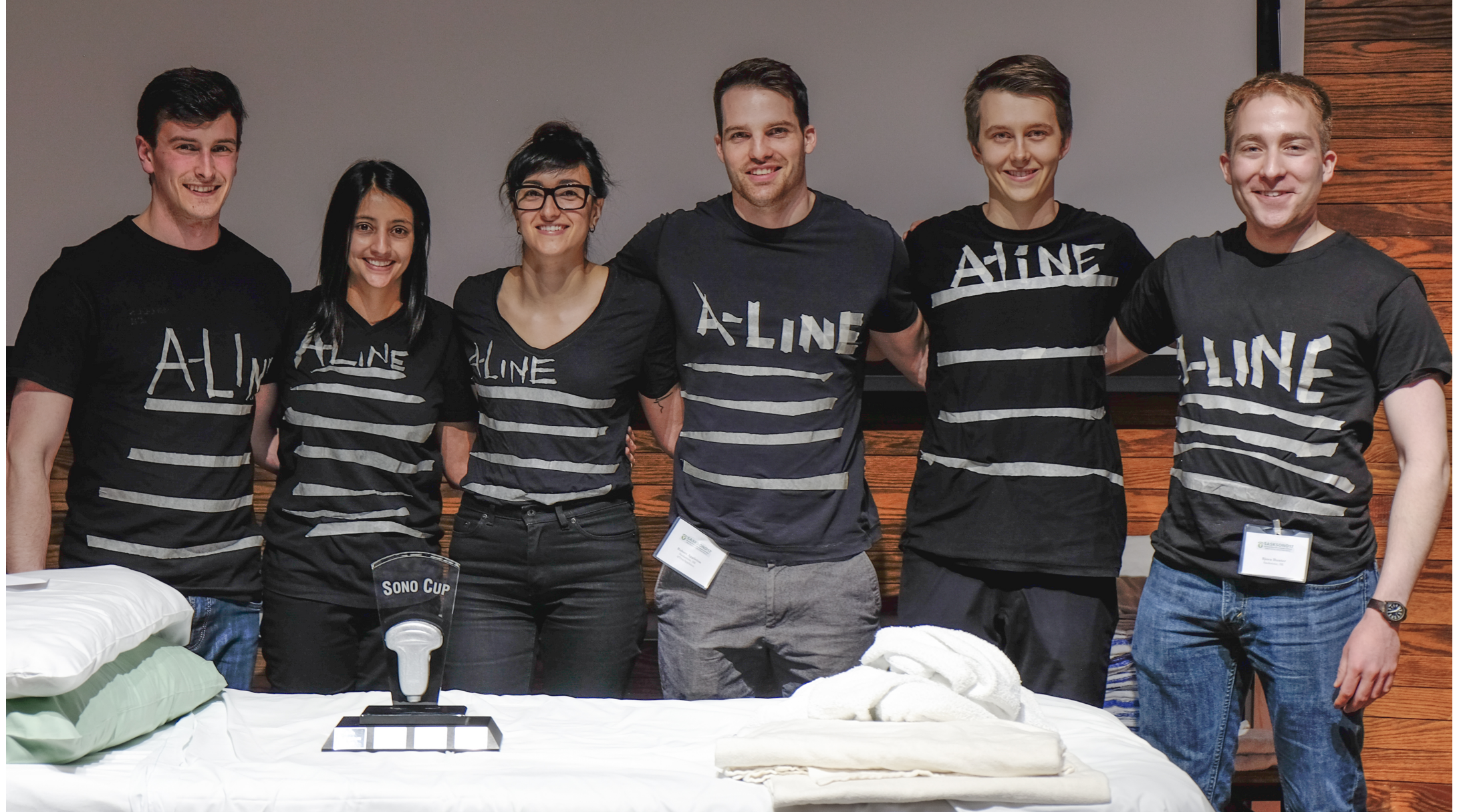
The A-LINES take it! SASKSONO17 SONOGAMES