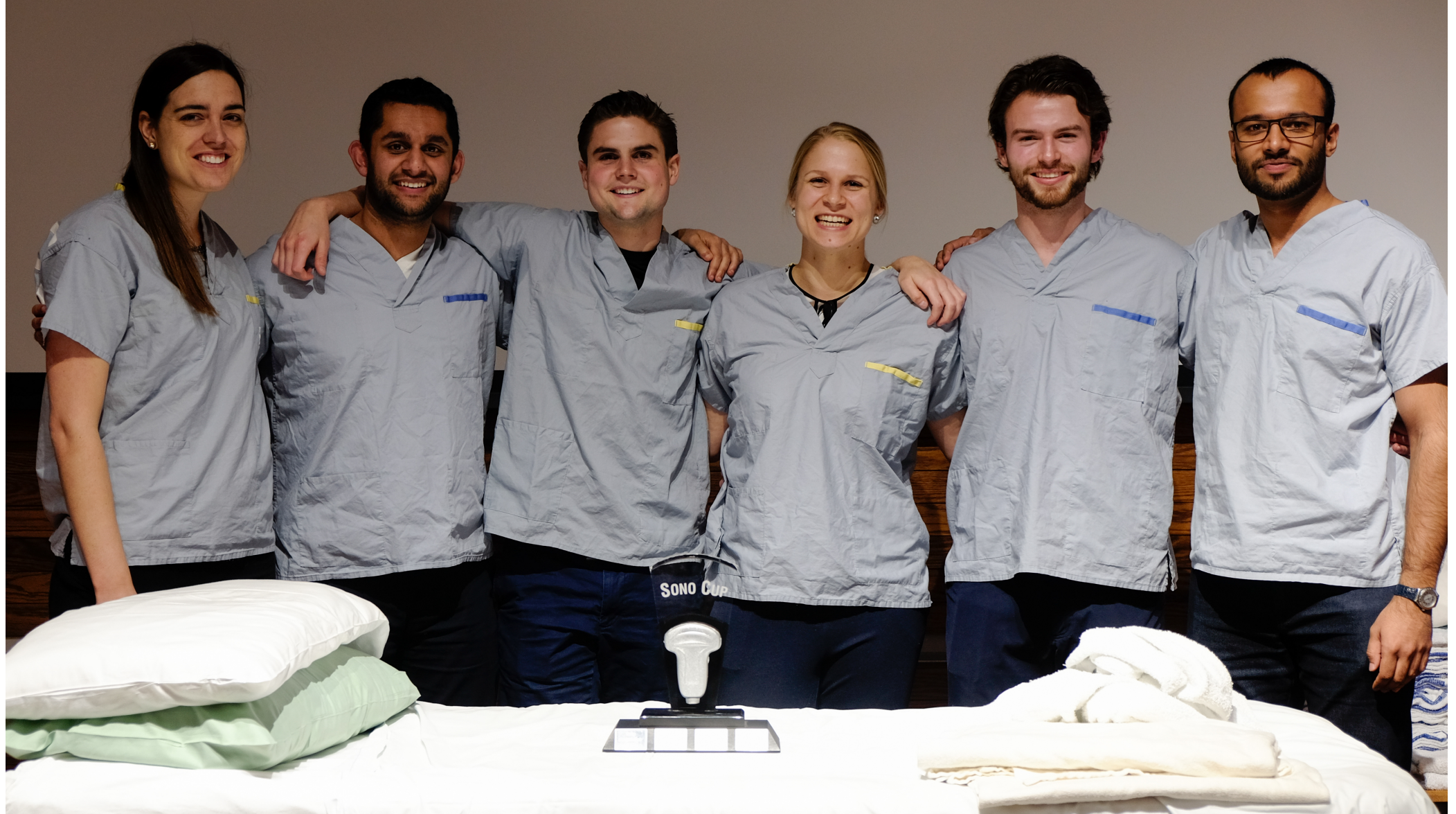
The SKANTRONS TAKE 2 ND ! SASKSONO17 SONOGAMES